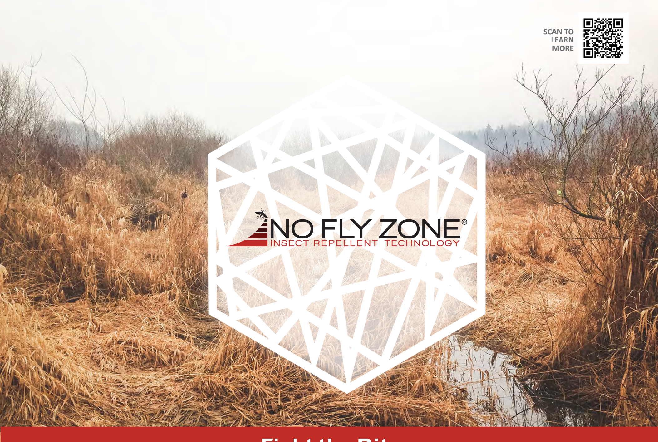
Fight the Bite