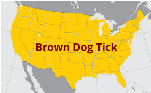
Brown Dog Tick

All three of these ticks can carry Lyme Disease and Rocky Mountain Spotted Fever.