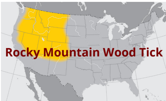
Rocky Mountain Wood Tick