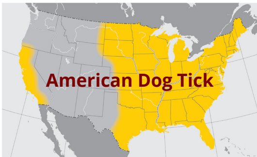
American Dog Tick